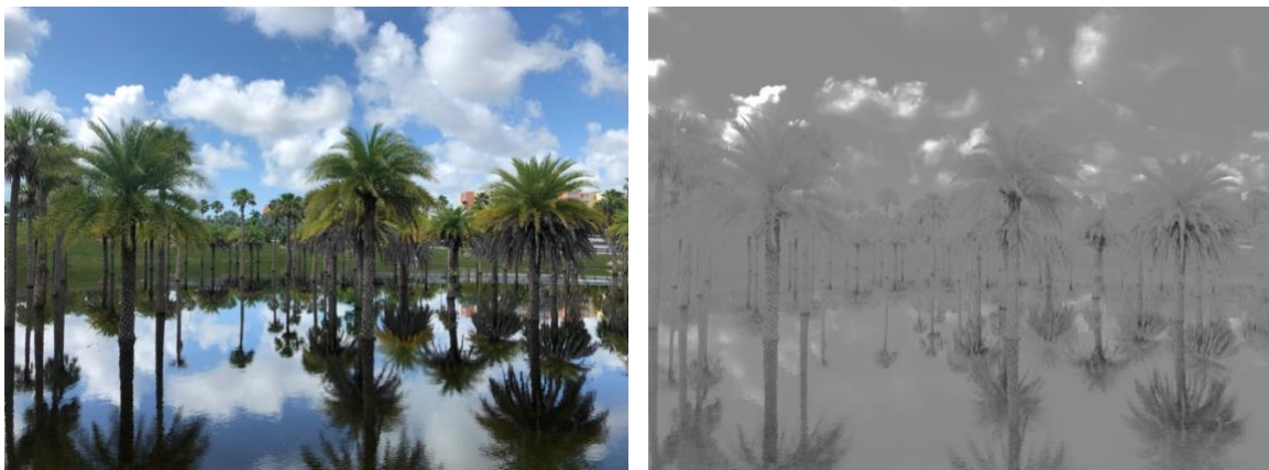
Fig. 1: Residual visual experience in type-2 blindsight represents very indeterminate color and shape properties.

Berit Brogaard (2015; Kentridge & Brogaard, 2017) proposes that the residual visual experiences of type-2 blindsight patients evince that visual experience can indeed represent highly indeterminate color properties. These experiences are described as of faint flashes, ill-defined poorly-formed blobs, or black shadows on a black background (Weiskrantz 1980; Shefrin et al. 1988). Brogaard suggests that they may be likened to photographs with very low contrast and resolution. See figure 1: